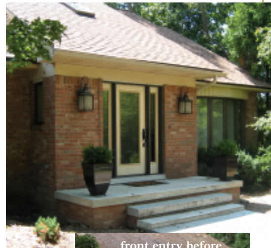
front entry before